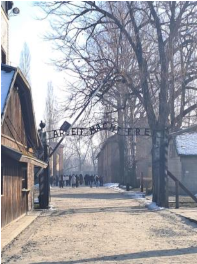
20th to 25th January 2025